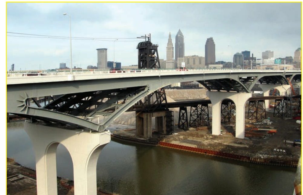
The new Westbound Innerbelt Bridge, courtesy Walsh/HNTB Innerbelt Project Team

The Ying and Yang of Asian culture inspired the Double Helix Bridge in Singapore. Built in 2010, the incredible 280-meter pedestrian bridge has a double spiral design that resembles the structure of DNA. Straightened out, it would measure 2,250 meters. The Double Helix Bridge weighs 1,700 tons, and was fabricated from 650 tons of duplex stainless steel and 1,000 tons of carbon steel. It was designed by an international design consortium of Australian architects Cox Group, engineers Arup and Singapore-based Architects 61.