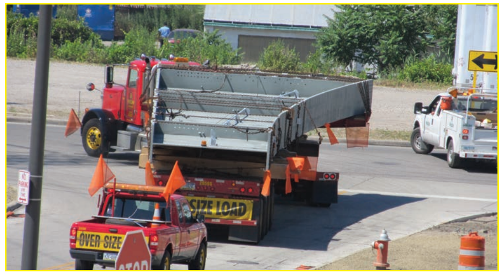
A knuckle girder is shipped from High Steel's Williamsport Plant

New Innerbelt Bridge Brings Modern, Innovative Design to Cleveland's Skyline continued from page 4