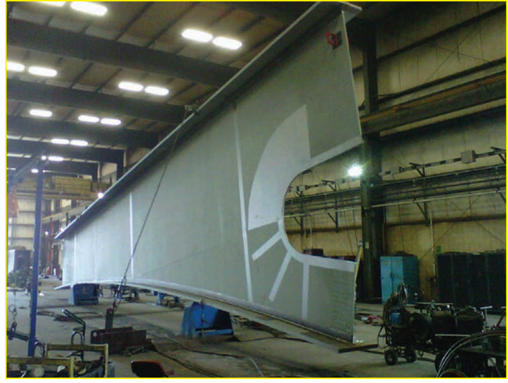
Knuckle girder in fabrication

"People that did not see these girders up close may not be able to comprehend just how large they are by looking at the bridge from a distance," Glidden comments. "There