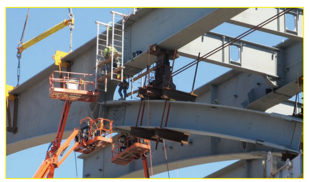
Erecting a Delta Frame